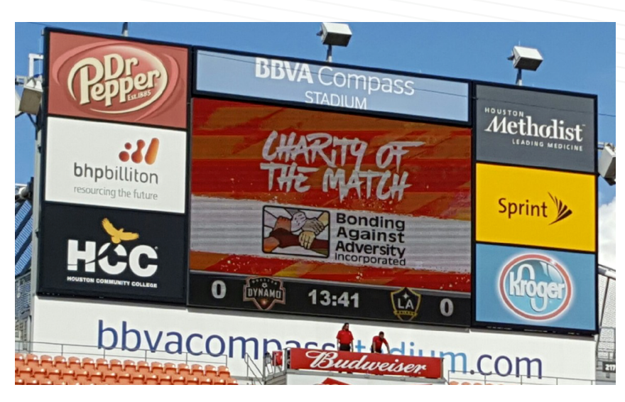
During the Houston Dynamos game, the team announced NAC partner Bonding Against Adversity on the jumbotron during the game as its "charity of the match."

The day of the Dynamo's match, BAA worked with 20 volunteers to help pass out 1,000 flyers, and 75 people registered to find out more information about citizenship services. In addition, BAA registered 30 people who were interested in helping to volunteer with the organization. While tabling, the organization tried to collect information from fans who were interested in finding out more information about citizenship, but this proved challenging as many attendees were reluctant to spend time learning about how to apply for citizenship.