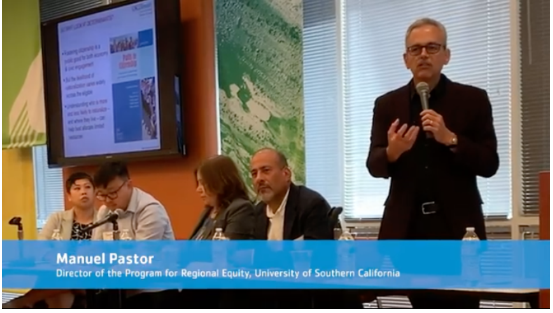
The YMCA of Metropolitan LA recommends inviting local subject matter experts to speak about pressing naturalization issues.